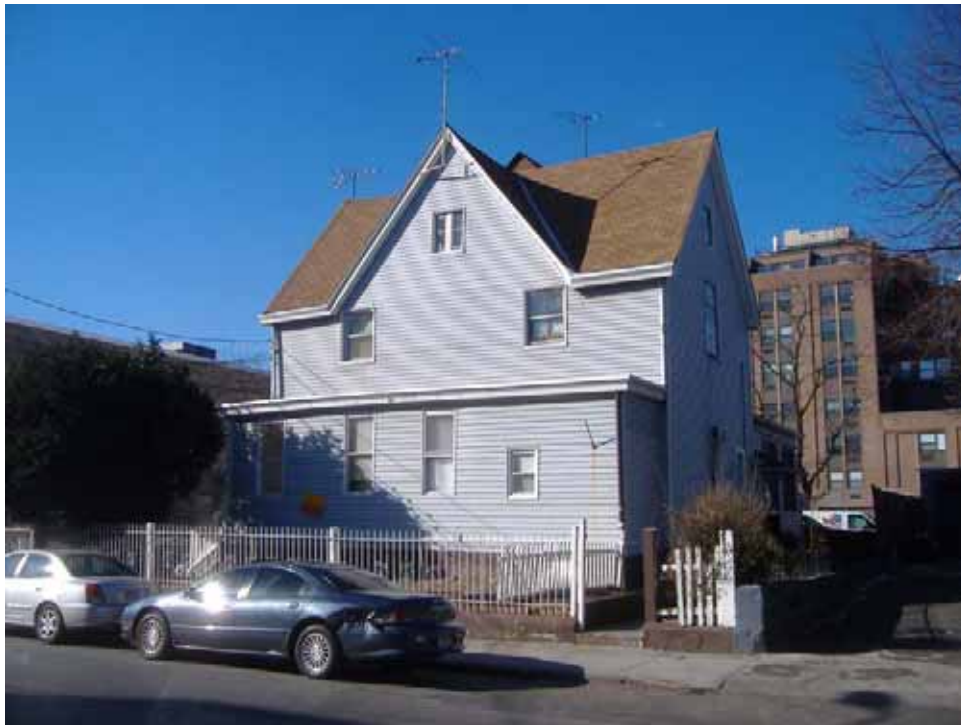
Photograph 149. Structure 290, 65 Buena Vista Avenue. A two-story wood-framed vernacular house, constructed c.1870.