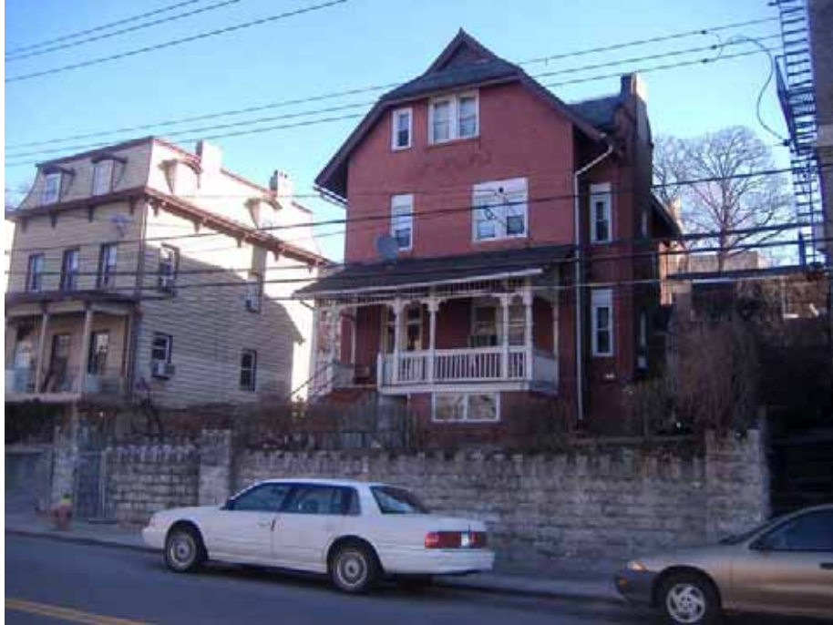
Photograph 162. Structure 309, 104 Buena Vista Avenue. A 2 ½ -story brick house, constructed c.1885.