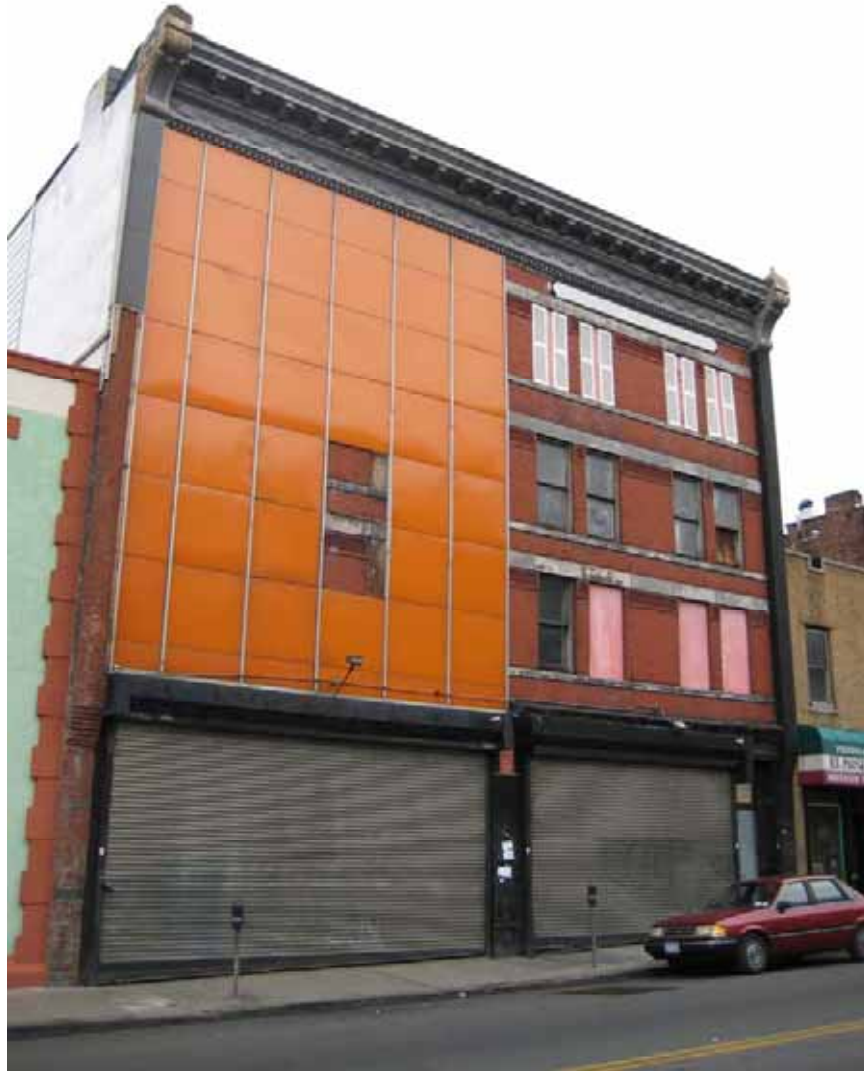
Photograph 174. Structure 339, 210-212 New Main Street. A three-story brick masonry mixed-use building with pressed tin cornice, constructed c.1890.