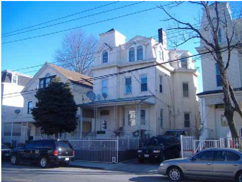
Photograph 151. Structure 293, 72 Buena Vista Avenue. A two-story wood-framed second empire house with a mansard roof, constructed c.1880.