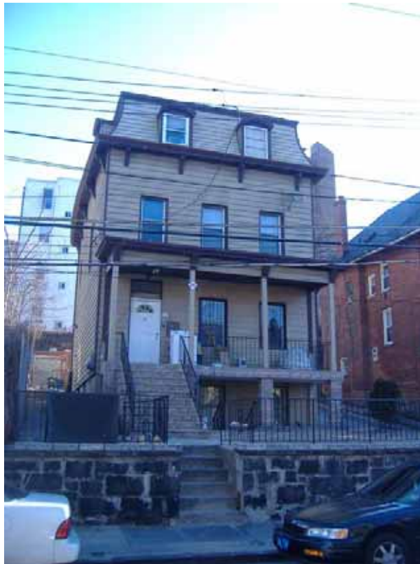
Photograph 163. Structure 310, 100 Buena Vista Avenue. A two-story wood-framed second empire house with a mansard roof, constructed c.1880.