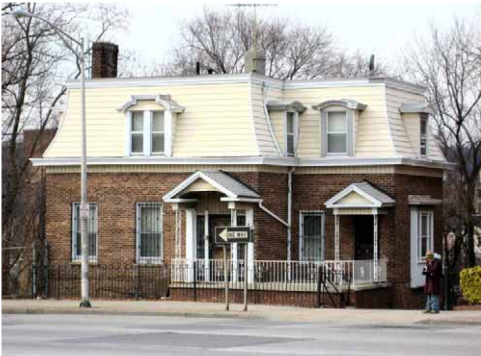
Photograph 134. Structure 248, 175 Nepperhan Avenue. A one-story brick cottage with a mansard roof, constructed c.1875.