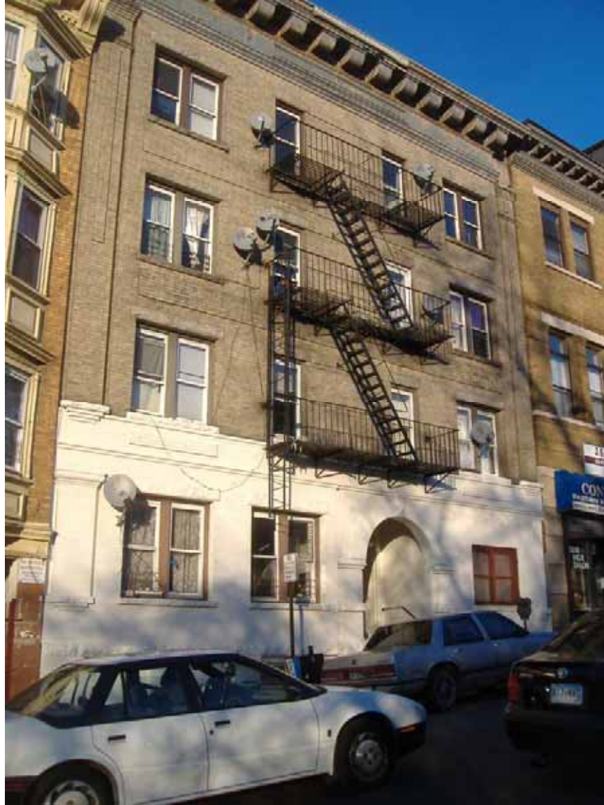
Photograph 128. Structure 240, 91 Elm Street. A four-story brick apartment building with decorative brick pilasters and pressed metal cornice, constructed c.1900.