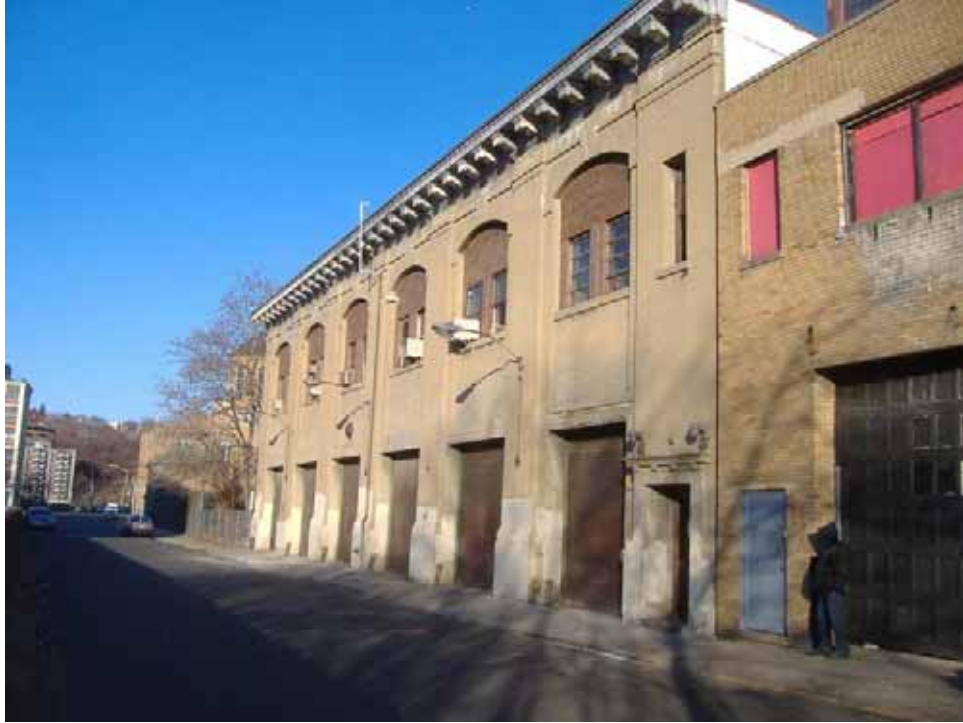
Photograph 126. Structure 237, 10 Casmir Avenue. A two-story masonry garage structure with faux stone façade, constructed c.1910.