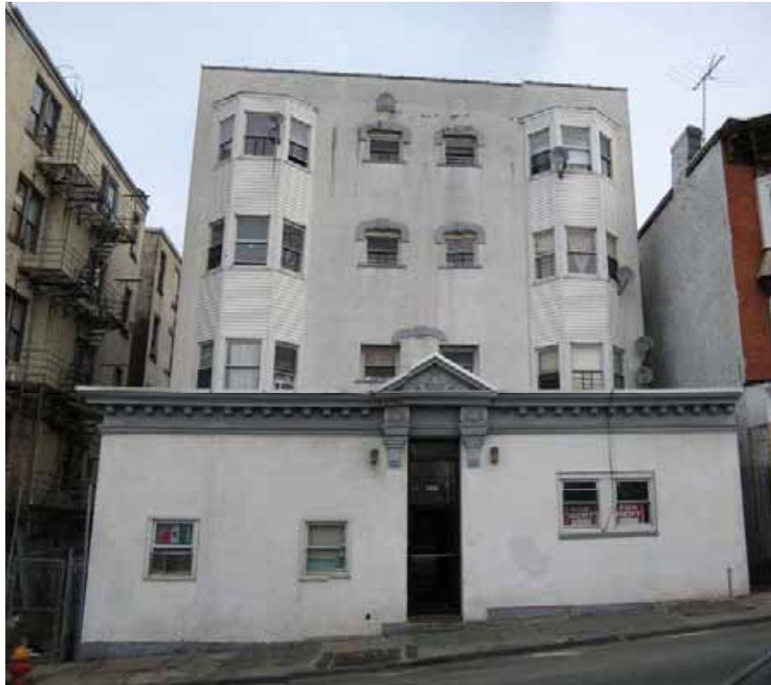
Photograph 142. Structure 278, 121 Elm Street. A four-story apartment building, with one story commercial pavilion, constructed c.1900.