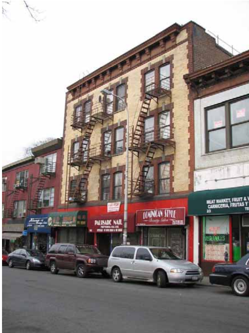
Photograph 123. Structure 226, 19-21 Palisade Avenue. A four-story brick masonry mixed-use building, constructed c.1890.