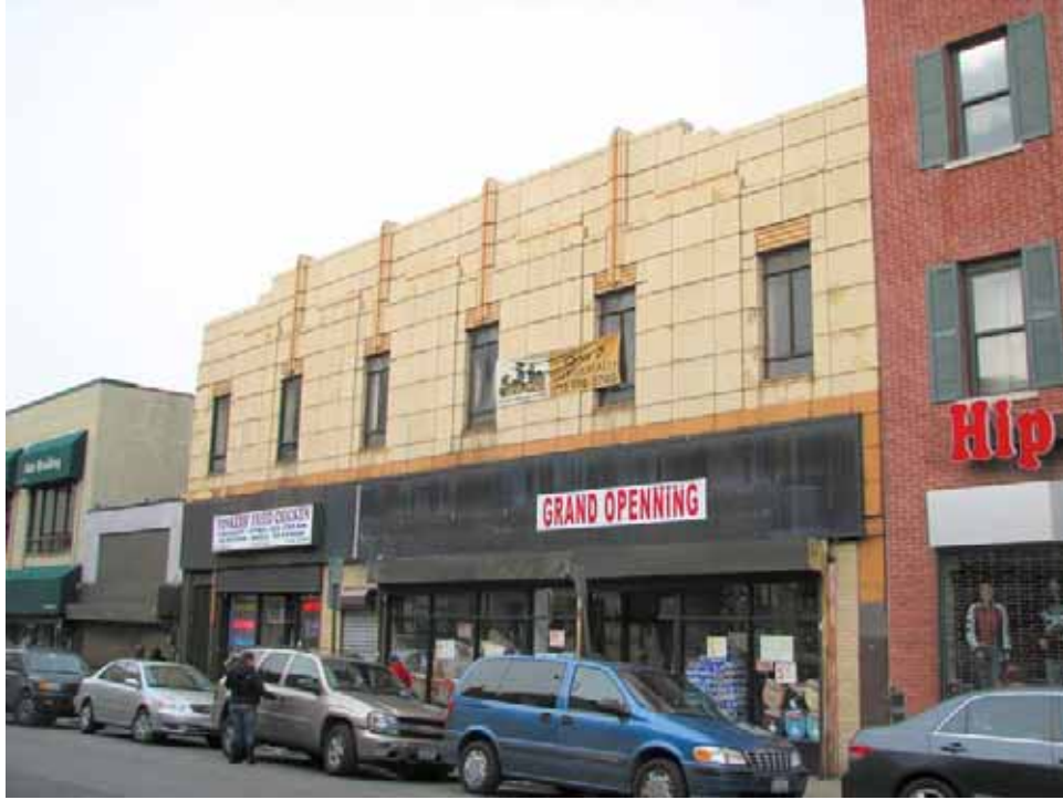
Photograph 120. Structure 213, 7-9 Palisade Avenue. A two-story brick commercial structure with terracotta front, constructed c.1930.