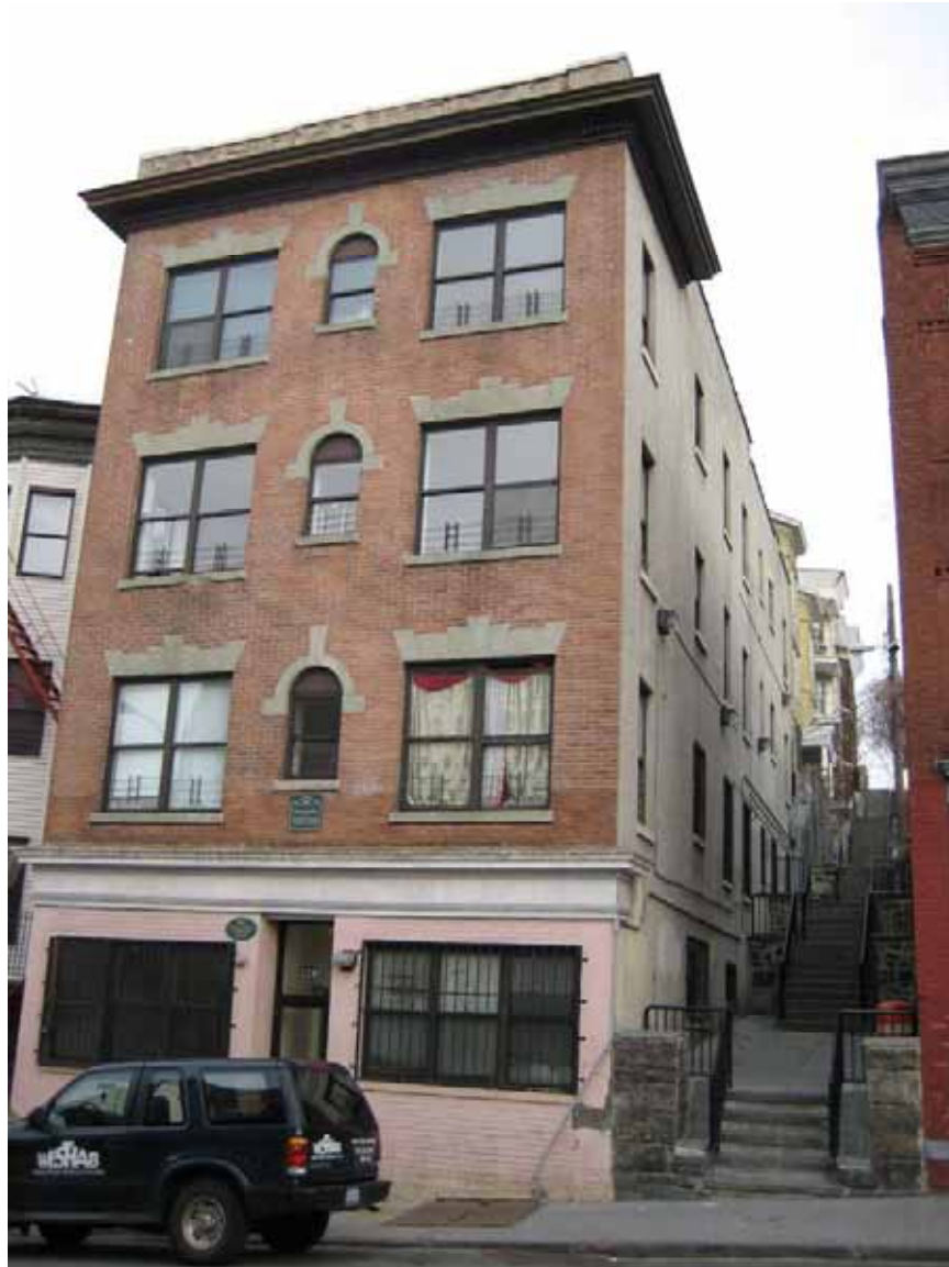
Photograph 145. Structure 282, 129 Elm Street. A four-story brick masonry mixed-use structure, constructed c.1920.