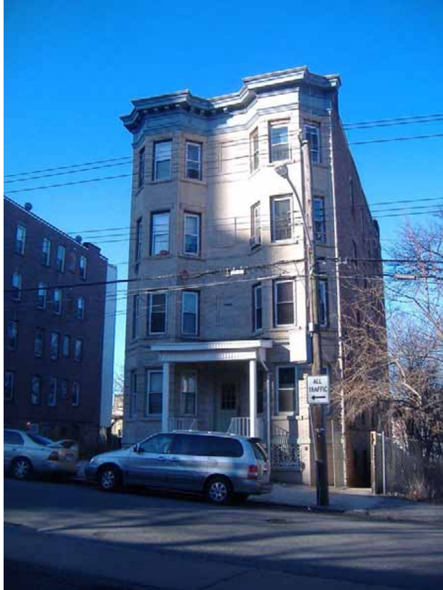
Photograph 165. Structure 313, 35 Hawthorne Avenue. A four-story brick apartment building, constructed c.1900.