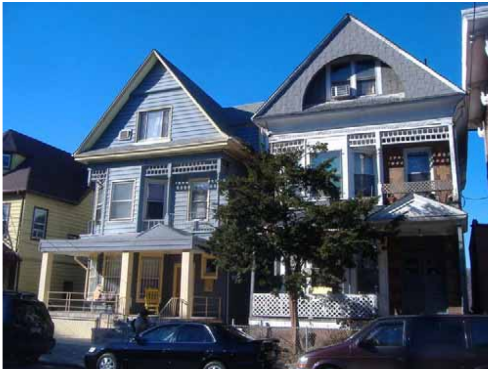
Photograph 158. Structure 305, 99 Buena Vista Avenue, at right. A two-story brick masonry house, constructed c.1890.