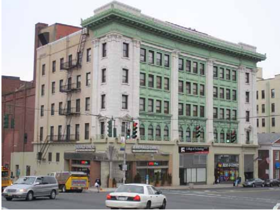
Photograph 170. Structure 325, 53 South Broadway. Formerly RKO Proctor's Theatre, this six-story brick masonry structure was designed by architect W. E. Lehman and was constructed in 1916.