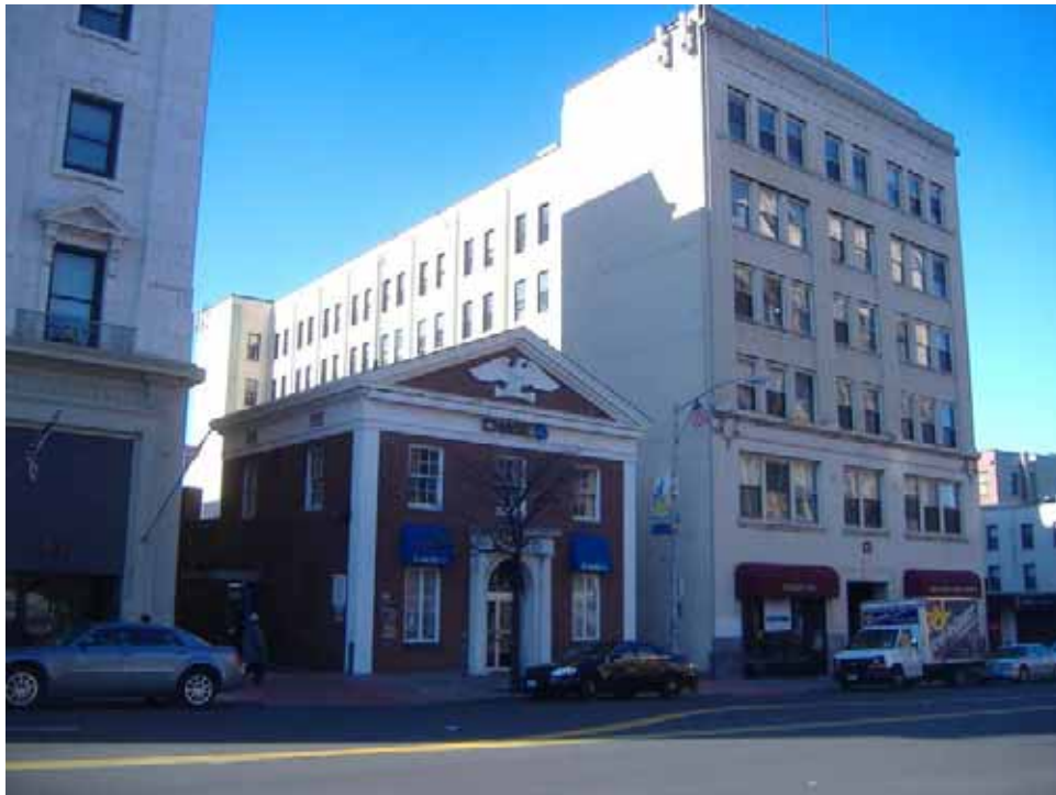
Photograph 169. Structures 323 and 324, 45 and 47 South Broadway. Structure 323 is a six-story brick masonry mixed-use structure, constructed c. 1900. Structure 324 is a two-story brick masonry neoclassical bank building, constructed c.1910.