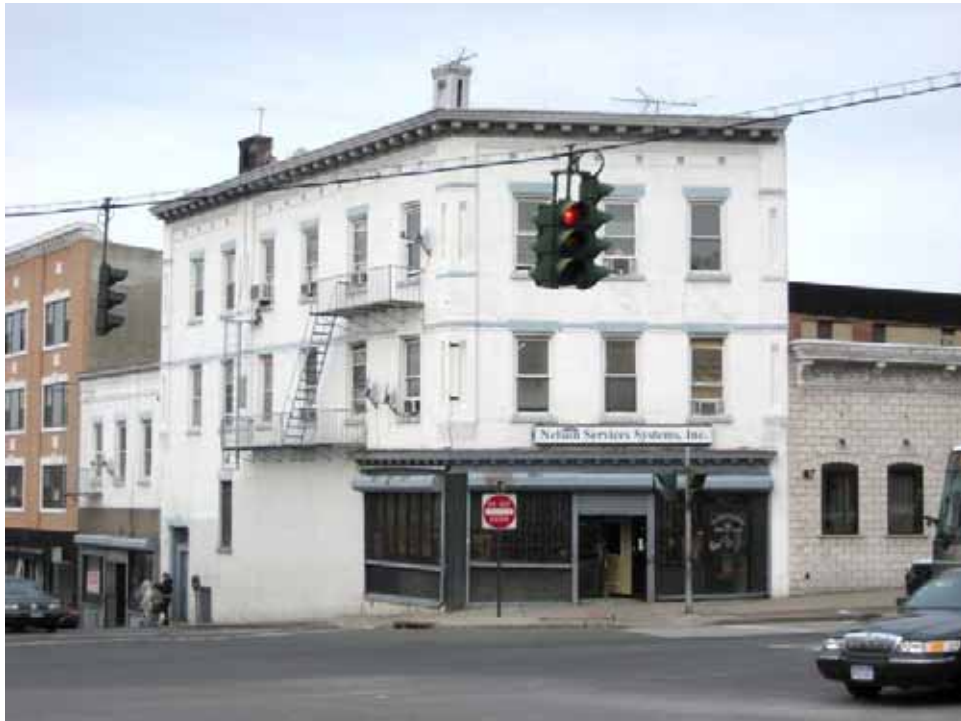
Photograph 132. Structure 246, 203 Nepperhan Avenue. A three-story brick masonry mixed-use structure, constructed c.1890.