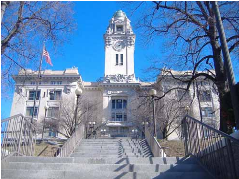
Photograph 171. Structure 328, 40 South Broadway, City Hall. A four-story brick masonry public building designed in 1907 by Edwin A. Quick & Sons.