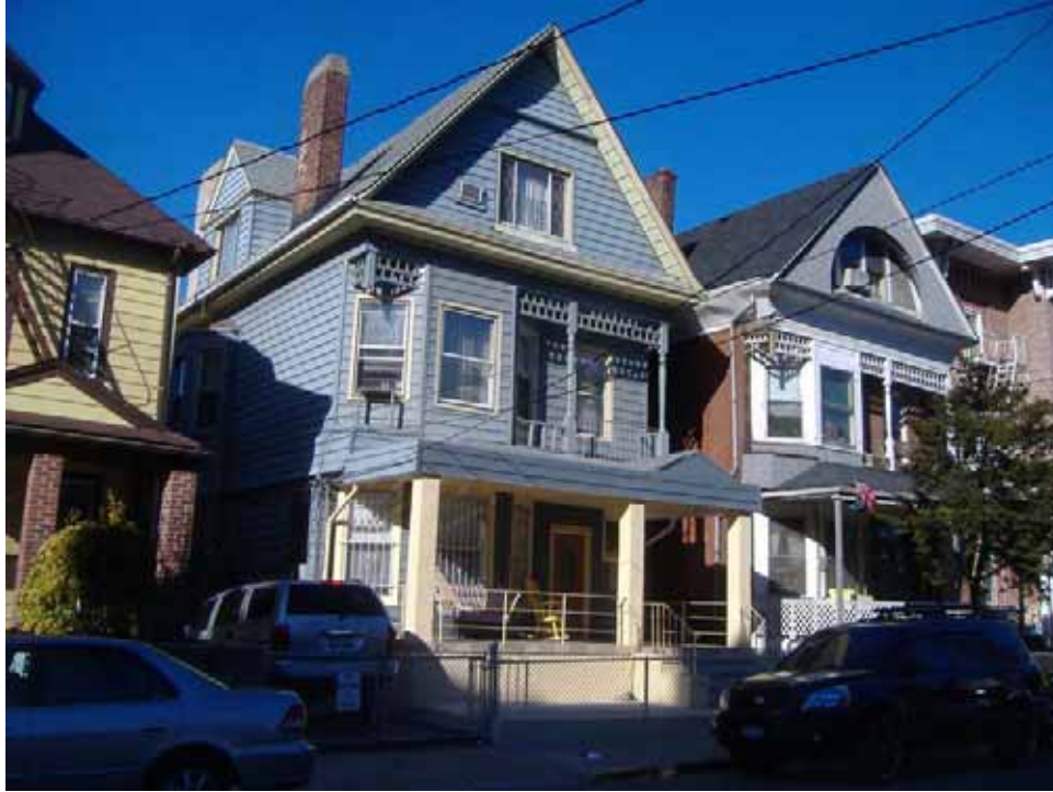
Photograph 159. Structure 306, 101 Buena Vista Avenue. A two-story, wood-framed house, at left, constructed c.1890.