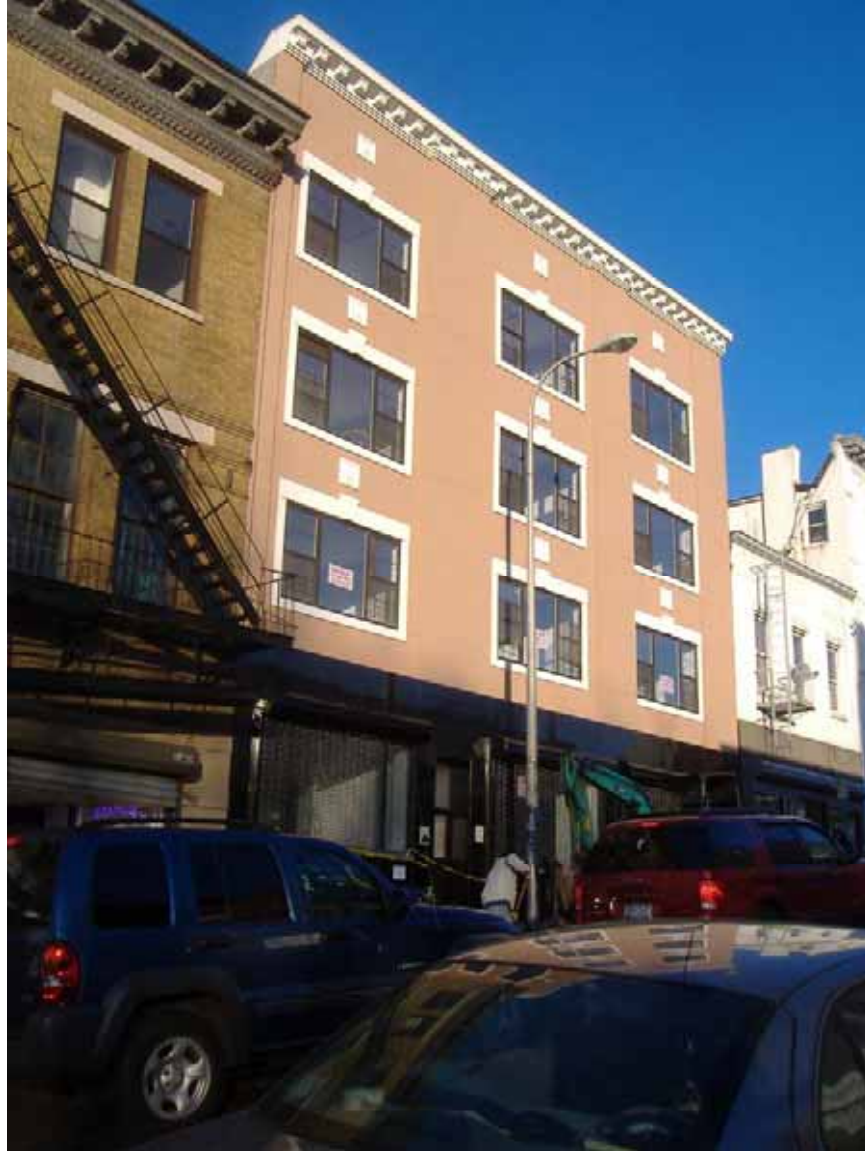
Photograph 129. Structure 242, 95 Elm Street. A four-story brick commercial building, constructed during the first quarter of the 20 th century.