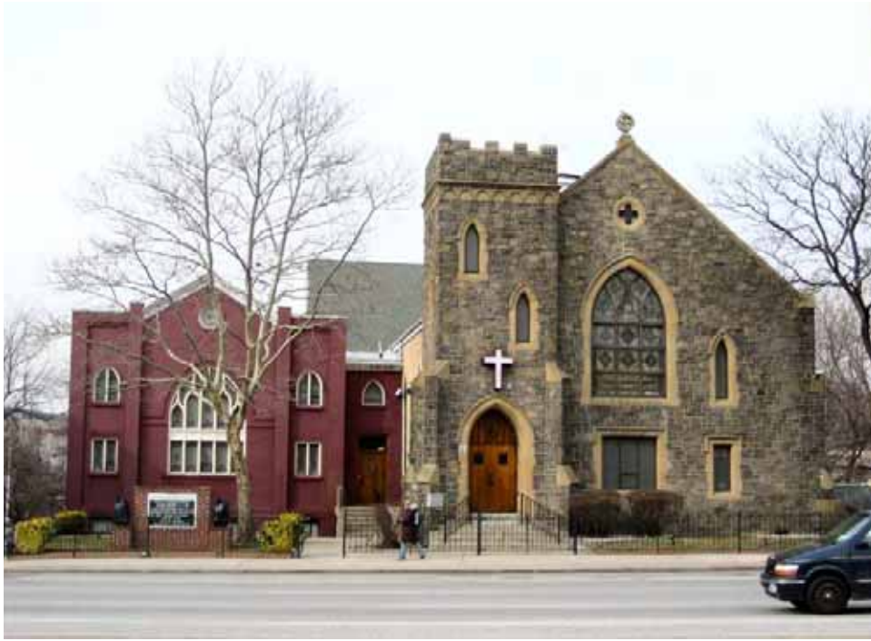
Photograph 133. Structure 247, 177 Nepperhan Avenue, Mt. Carmel Baptist Church. A stone gothic revival church, constructed c.1870, with early 20 th century gothic revival replacement.