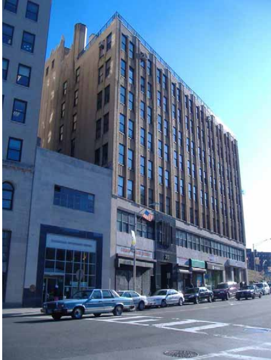
Photograph 172. Structure 329, 30 South Broadway. An eight-story brick commercial and office building, constructed during the second quarter of the 20 th century.