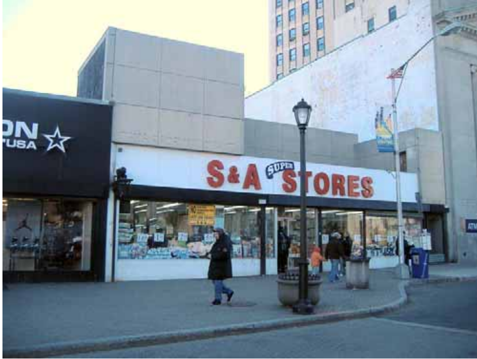
Photograph 118. Structure 208, 10 South Broadway. A one-story precast concrete commercial structure, constructed c.1940.