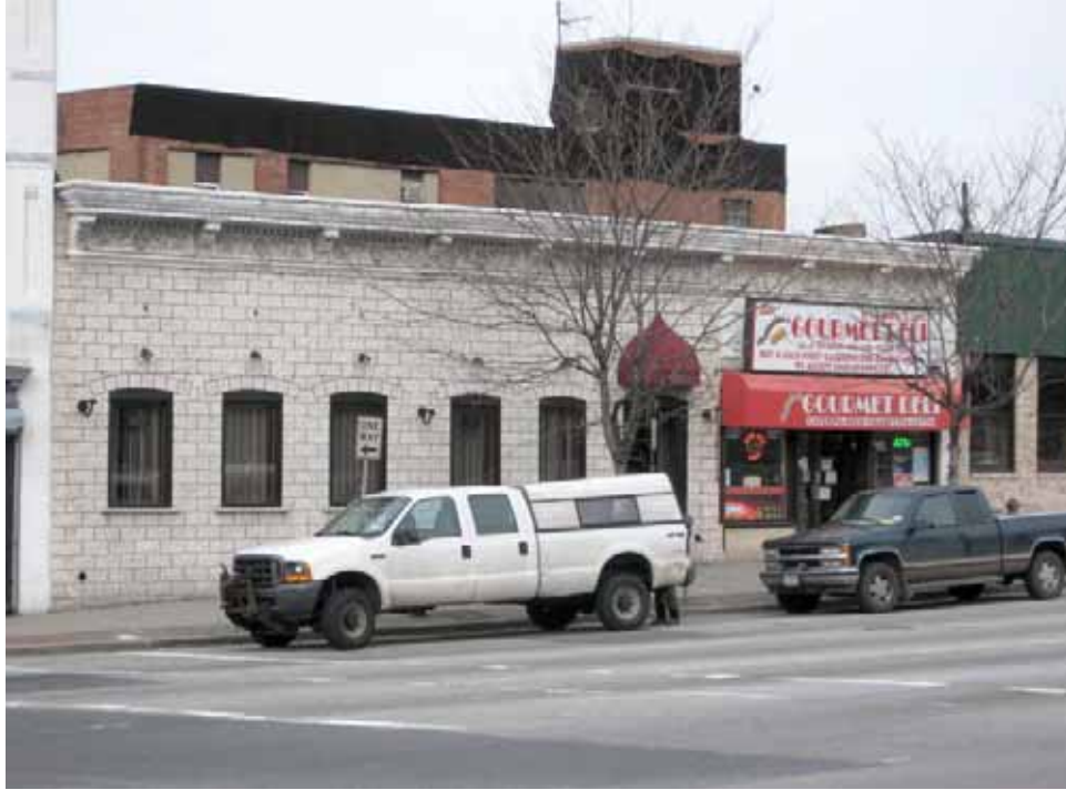
Photograph 131. Structure 245, 205 Nepperhan Avenue. A one-story commercial building, constructed c.1895.