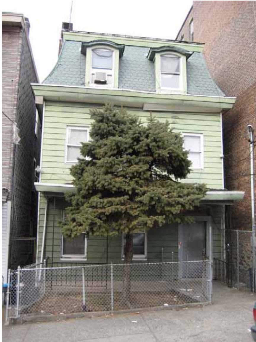
Photograph 139. Structure 264, 45 Linden Street. A two-story wood-framed house with a mansard roof, constructed c.1875.