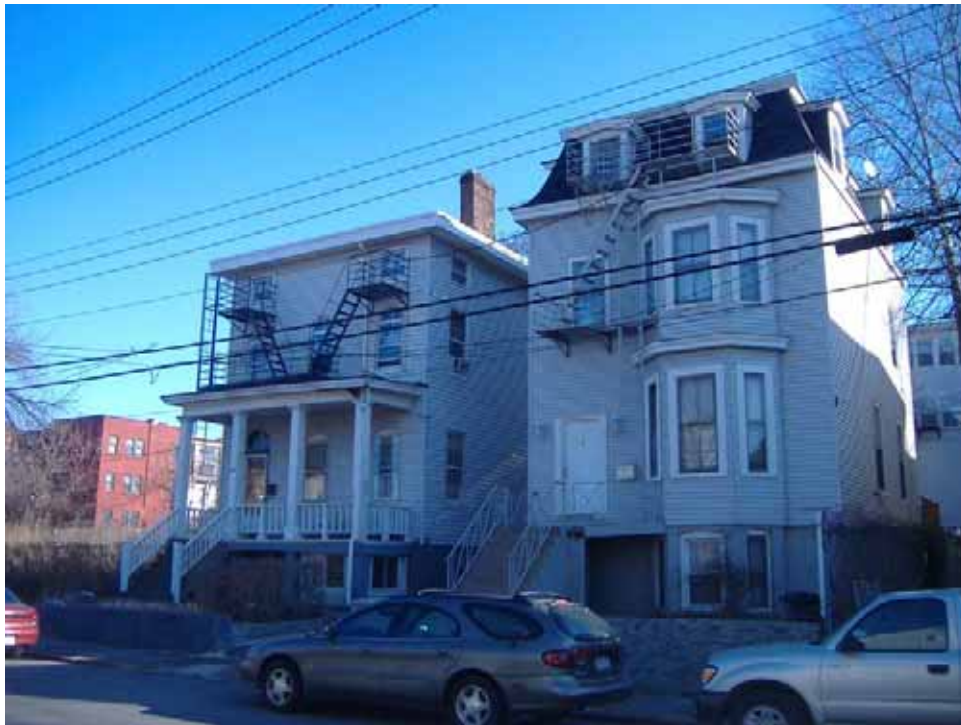
Photograph 153. Structure 295, 66 Buena Vista Avenue, at right. A two-story wood-framed second empire house with a mansard roof, constructed c.1880.