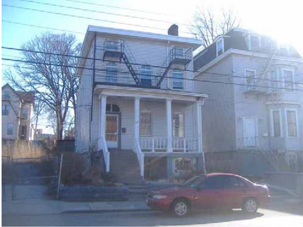
Photograph 154. Structure 296, 62 Buena Vista Avenue. A 2½ -story wood-framed house, constructed c.1870.