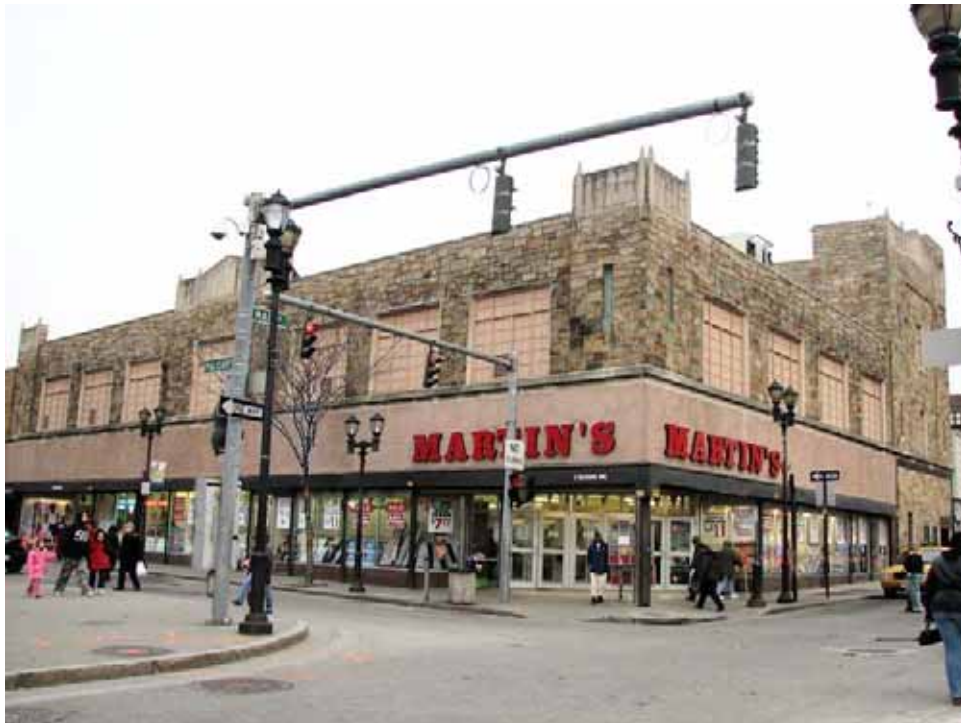
Photograph 119. Structure 211, 2 Palisade Avenue. The W. T. Grant (C.H. Martin) Building is a two-story stone-faced commercial building with gothic detailing, constructed c.1925.