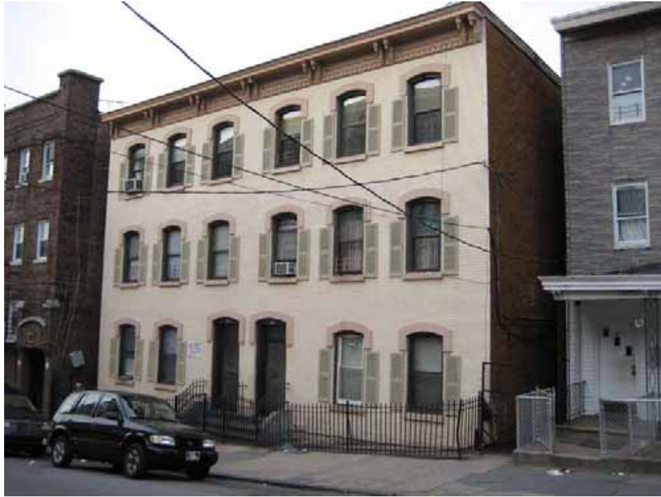
Photograph 138. Structure 262, 49-51 Linden Street. A three-story brick masonry double house, constructed c. 1880.