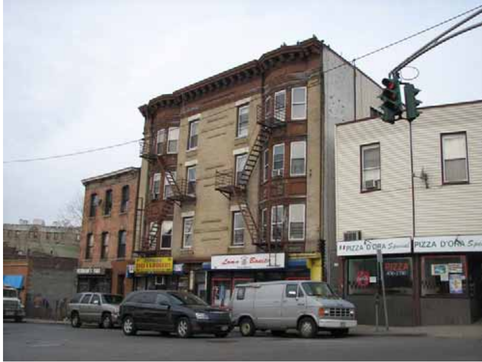
Photograph 124. Structure 234, 45 Palisade Avenue. A four-story brick mixed-use structure with Italianate pressed metal cornice, constructed c.1900.