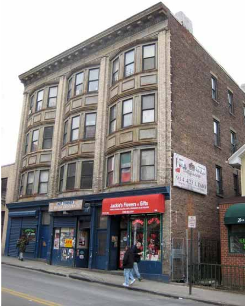
Photograph 135. Structure 258, 106-108 Elm Street. A four-story brick mixed-use structure with bayed fronts, constructed c.1895.