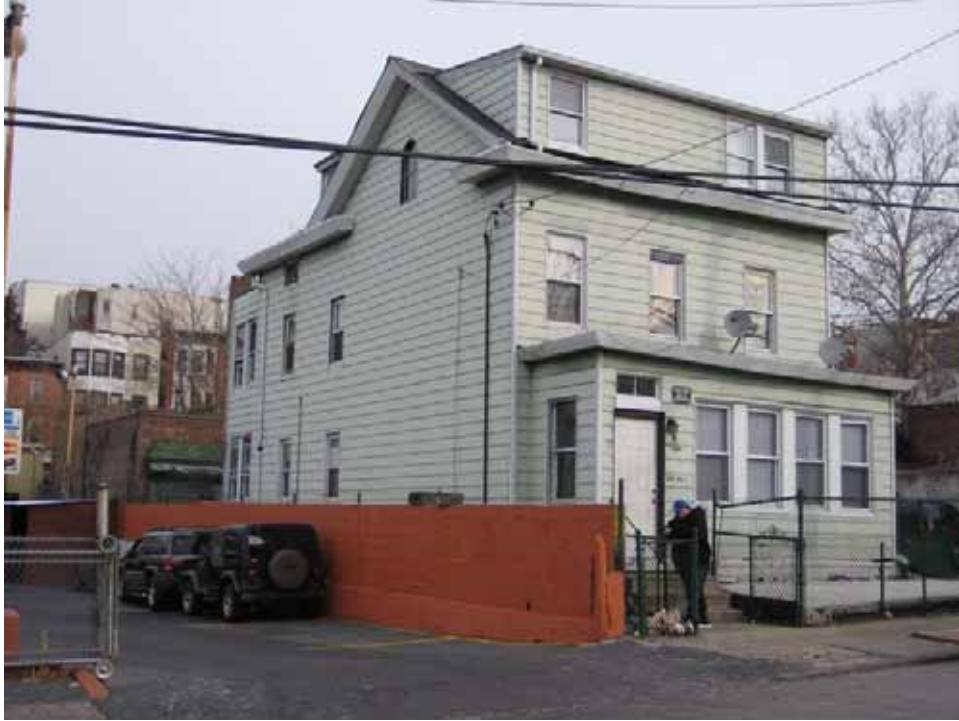
Photograph 146. Structure 287, 35 Ash Street. A two-story wood-framed house, constructed c.1870.