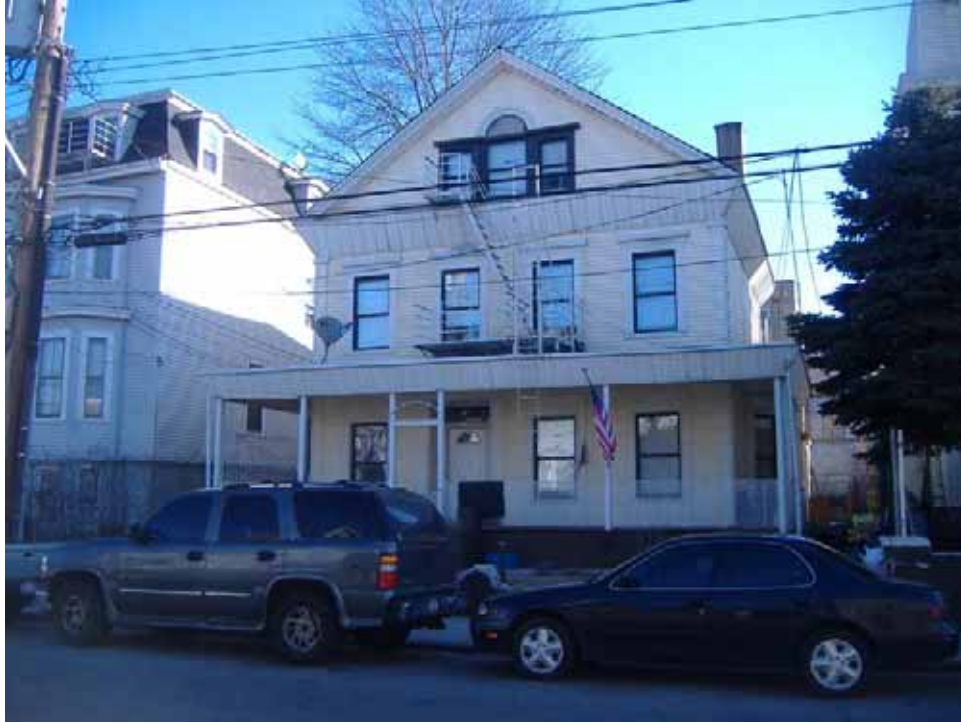
Photograph 152. Structure 294, 68 Buena Vista Avenue. A two-story, wood-framed house, constructed in the 19 th century.