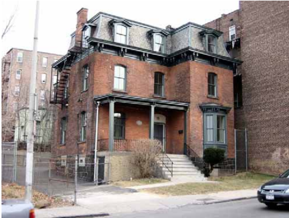
Photograph 136. Structure 260, 103 Elm Street. A two-story brick masonry house with mansard roof, constructed c. 1875.