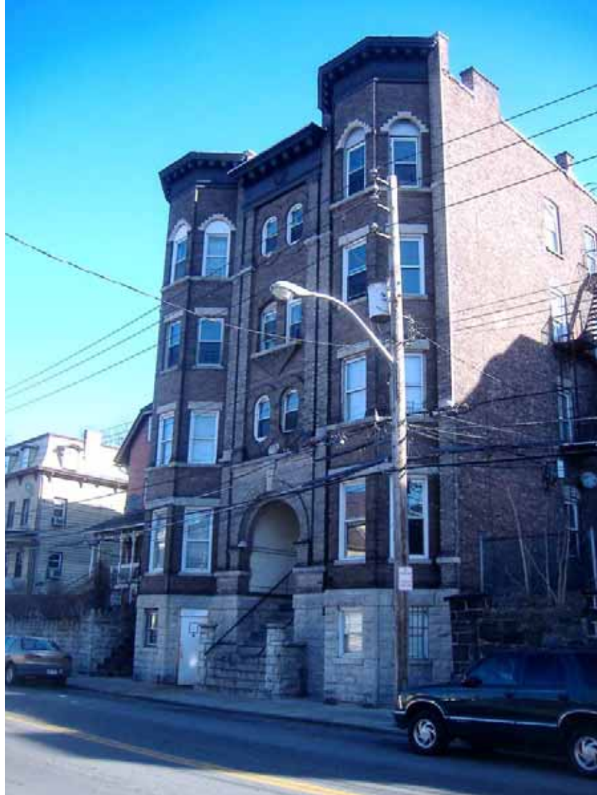
Photograph 161. Structure 308, 108-110 Buena Vista Avenue. A four-story brick masonry apartment building on high limestone basement, constructed c.1900.