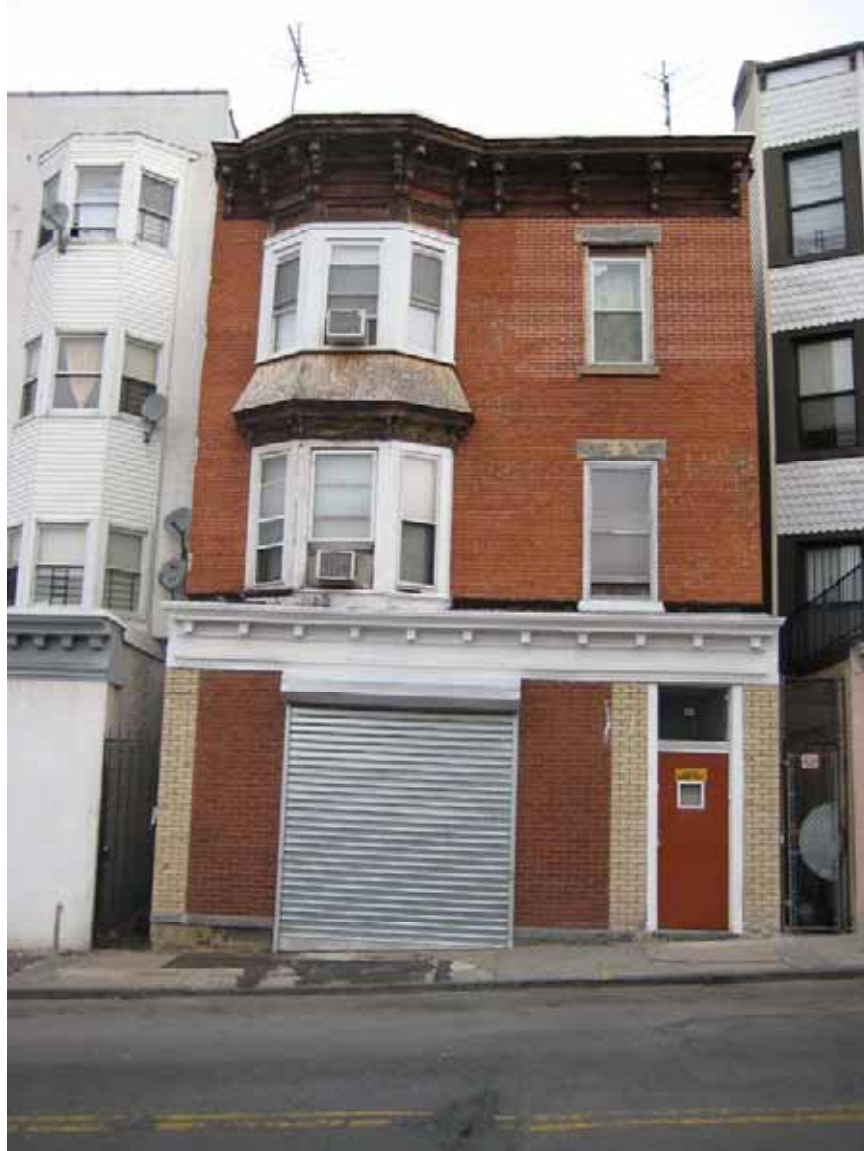
Photograph 143. Structure 279, 123 Elm Street. A three-story brick mixed-use structure, constructed c.1880.