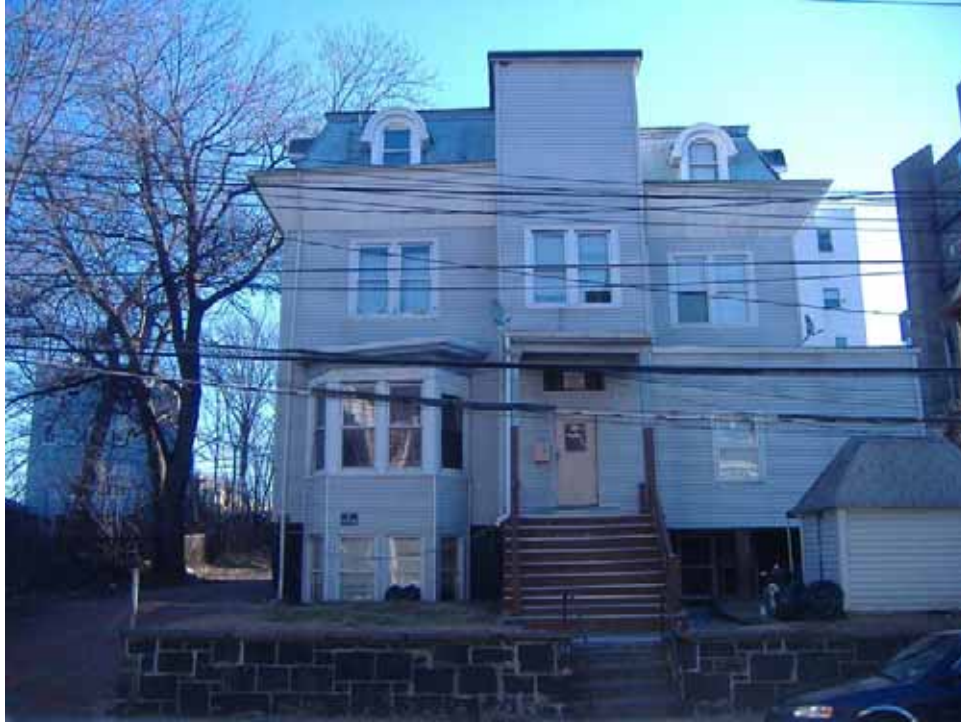
Photograph 164. Structure 311, 94 Buena Vista Avenue. A two-story wood-framed second empire house with a mansard roof, constructed c.1880.