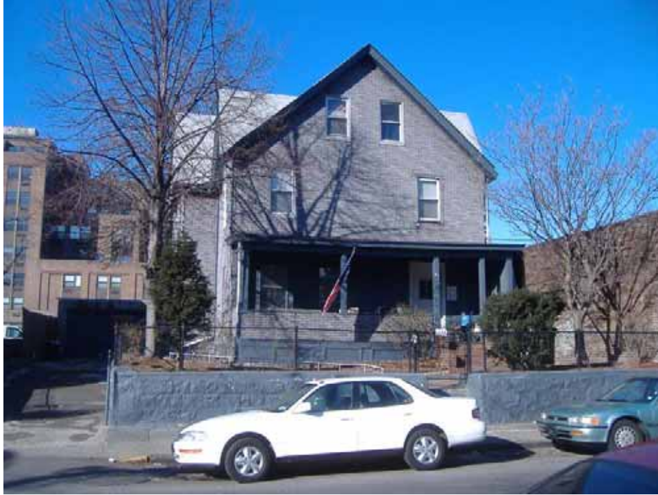
Photograph 148. Structure 289, 61 Buena Vista Avenue. A two-story wood-framed house, constructed c.1880.