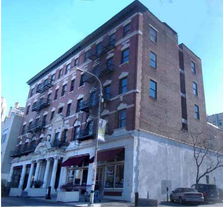
Photograph 167. Structure 319, 2-8 Hudson Street. The Phillipsburgh Building is an Italian Renaissance style commercial building designed by G. Howard Chamberlin and constructed in 1904.