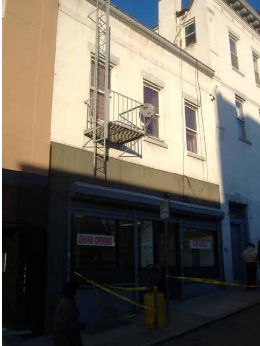
Photograph 130. Structure 243, 97 Elm Street. A two-story brick mixed-use structure, constructed c.1900.