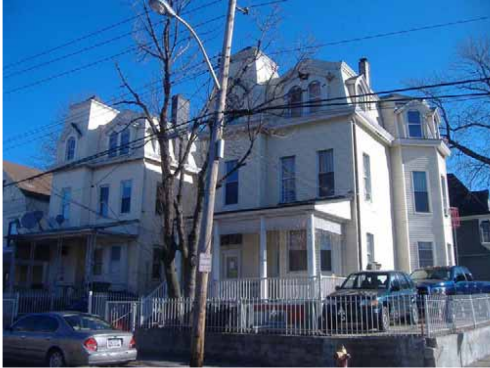
Photograph 150. Structure 292, 76 Buena Vista Avenue. A two-story wood-framed second empire house with a mansard roof, constructed c.1880.