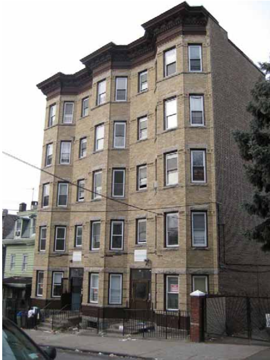
Photograph 140. Structure 265, 41-43 Linden Street. A five-story brick apartment building constructed c.1900.