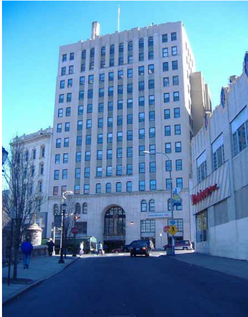
Photograph 173. Structure 331, 20 South Broadway. The First National Bank Building is a twelve-story commercial and office building, constructed c.1925.