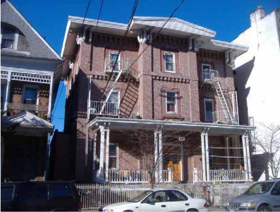
Photograph 157. Structure 304, 95 Buena Vista Avenue. A three-story brick masonry house, constructed c.1865.