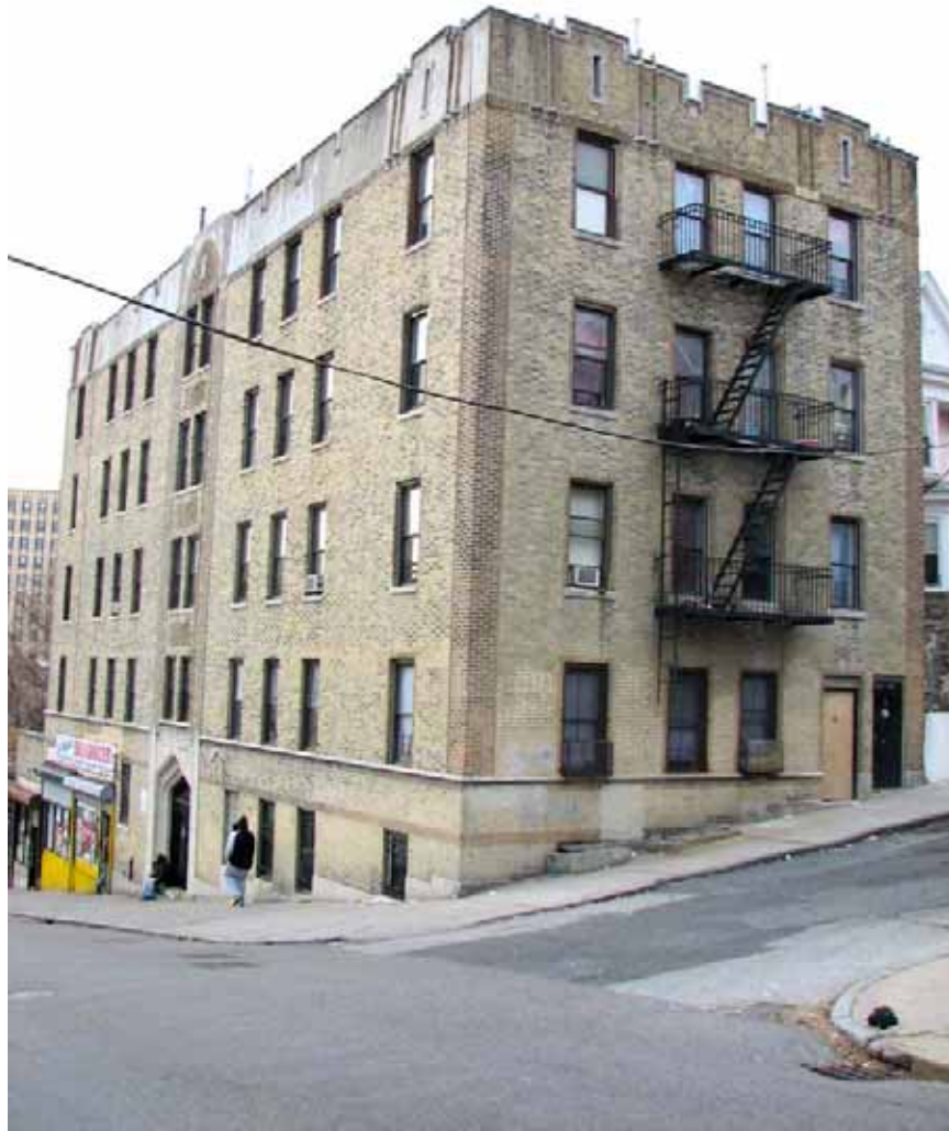
Photograph 122. Structure 220, 15 Locust Hill Avenue. Locust Hill Apartments, a five-story brick apartment structure with gothic revival, constructed during the first quarter of the 20 th century.