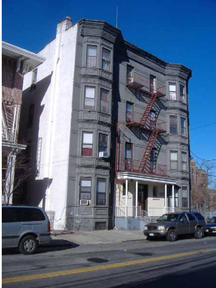
Photograph 156. Structure 303, 89 Buena Vista Avenue. A four-story brick apartment building with pressed tin and cast metal decorative elements, constructed c.1900.