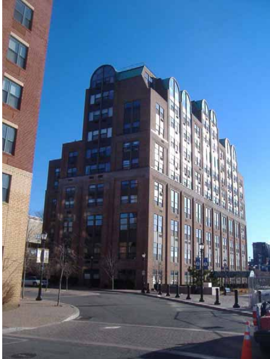
Photograph 147. Structure 288, 23 Water Grant Street. A ten-story brick apartment building, modified from an earlier industrial building constructed in the early 20 th century.