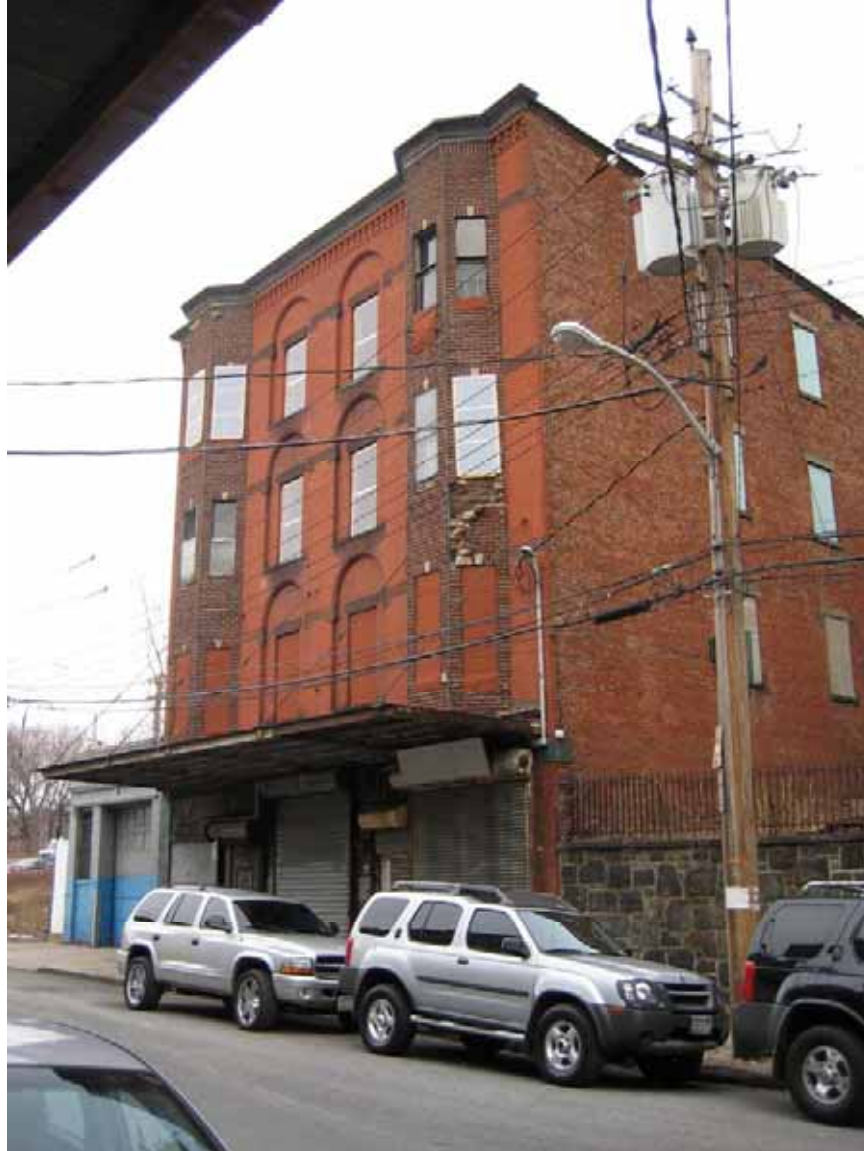
Photograph 175. Structure 350, 14 School Street. A four-story brick masonry mixed-use building, constructed c.1890.