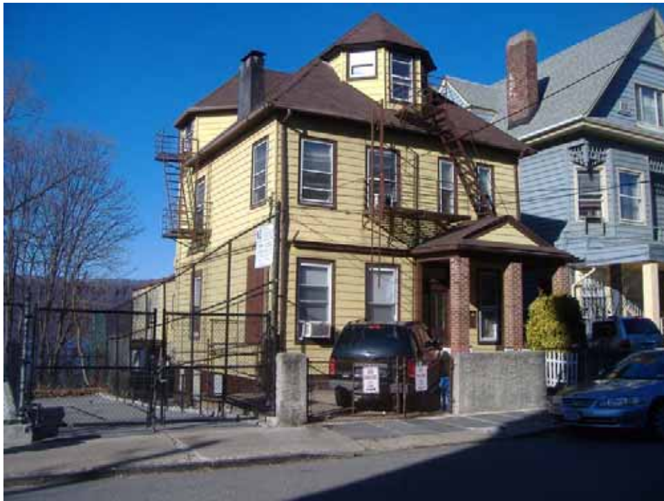
Photograph 160. Structure 307, 105 Buena Vista Avenue. A two-story wood-framed house, constructed c. 1900.