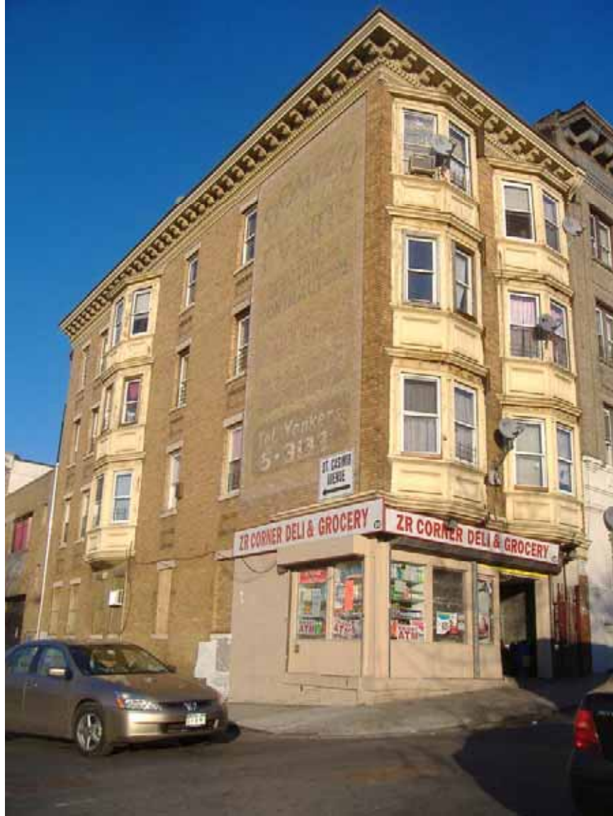
Photograph 127. Structure 239, 89 Elm Street. A four-story brick masonry mixed-use structure, constructed c.1900.