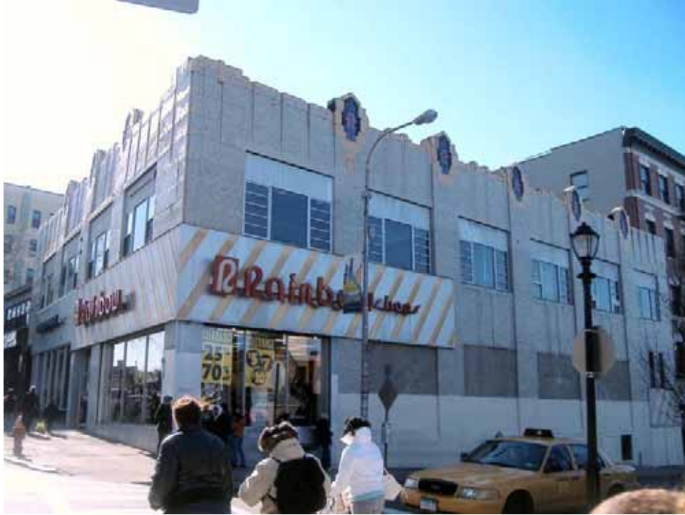
Photograph 168. Structure 320, 27-31 South Broadway. A two-story brick commercial building with art deco terracotta details, constructed c.1930.