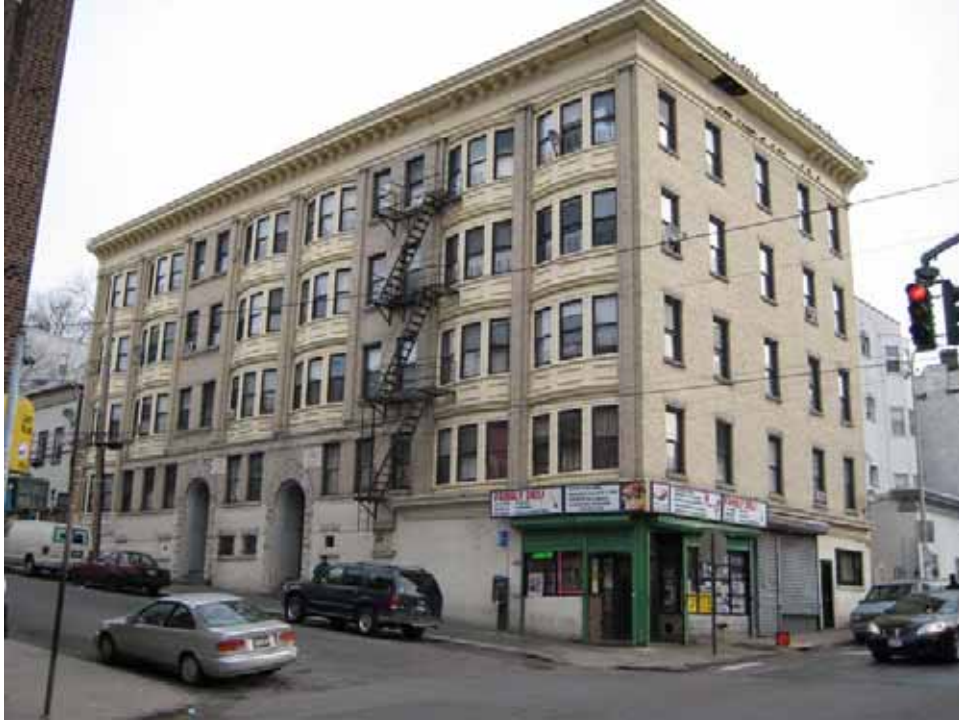
Photograph 141. Structure 277, 52-54 Linden Street. A five story brick apartment building with corner grocery, constructed c.1900.