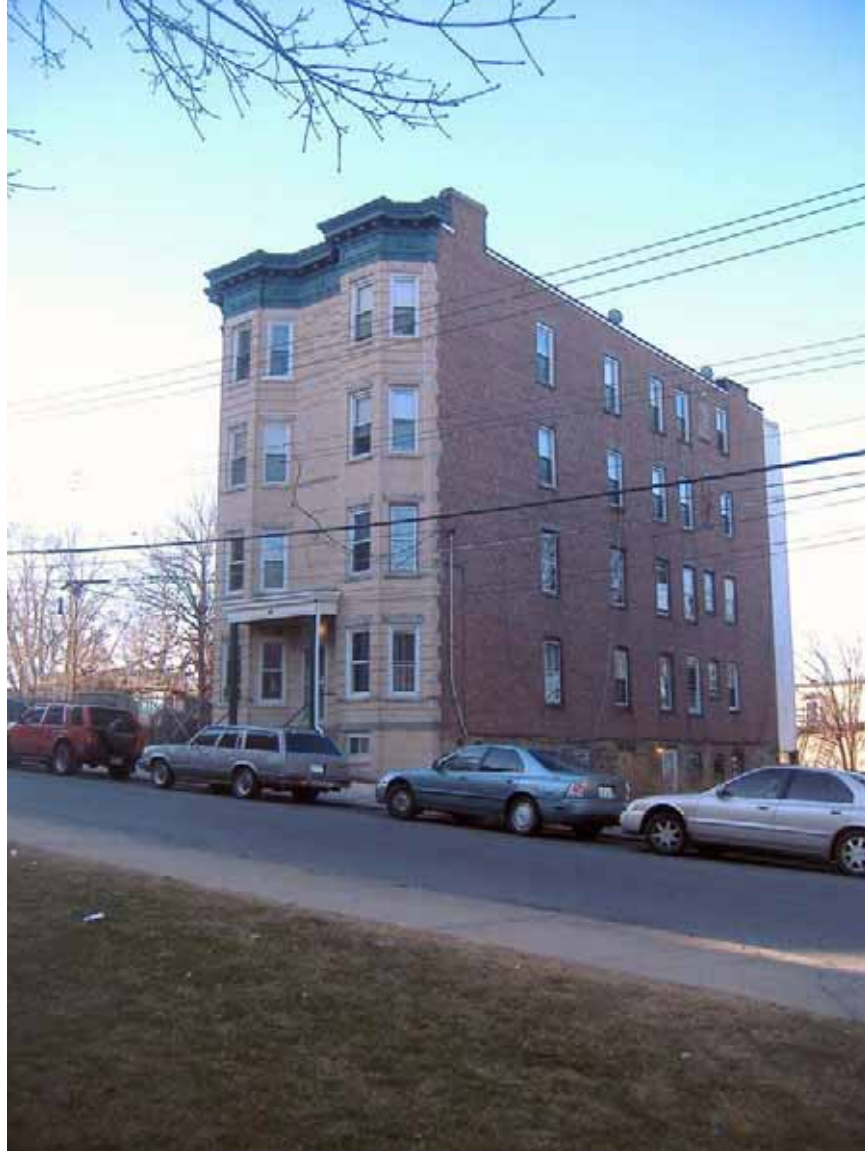
Photograph 166. Structure 314, 41 Hawthorne Avenue. A four-story brick apartment building, constructed c.1900.