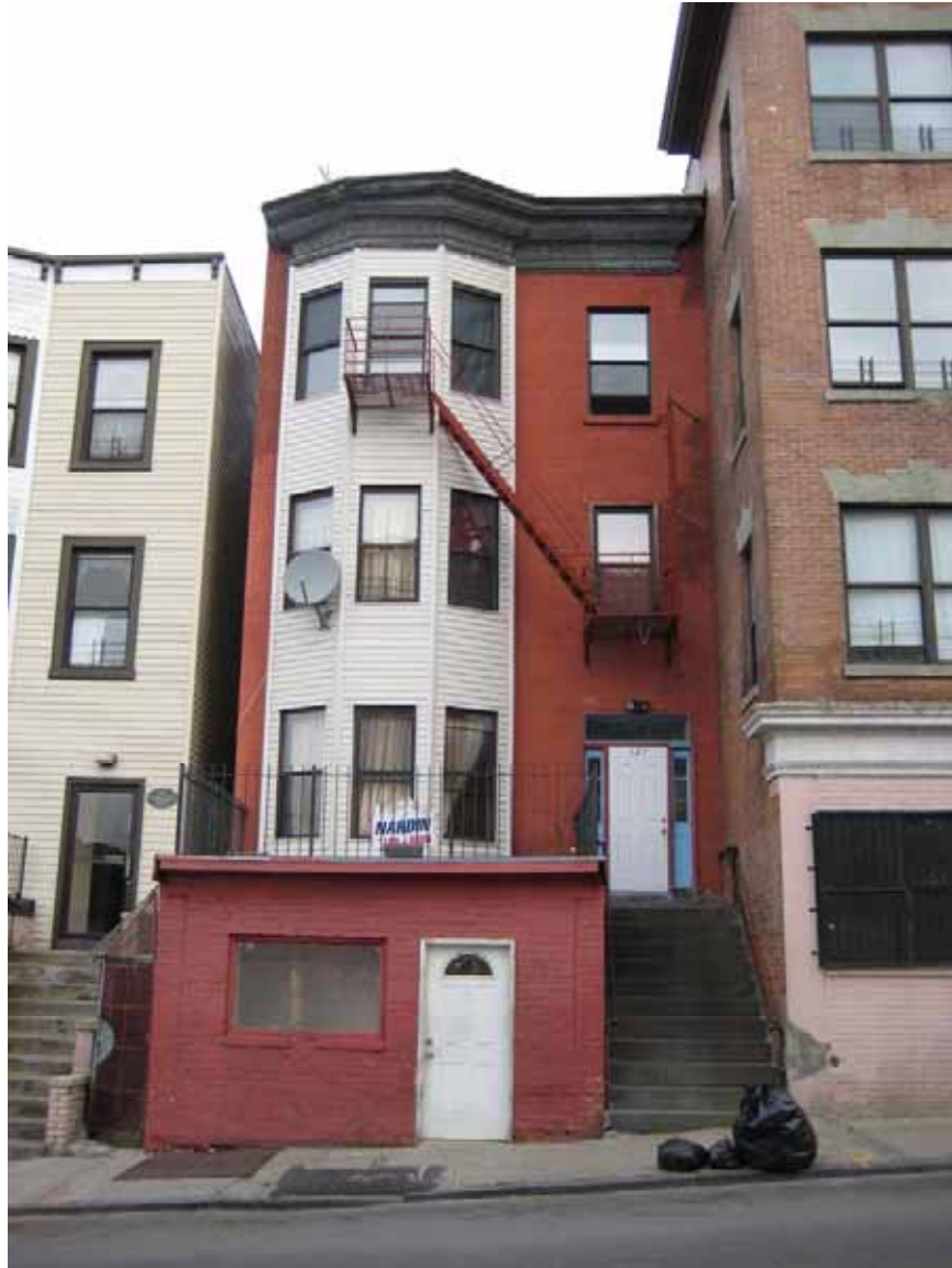
Photograph 144. Structure 281, 127 Elm Street. A three-story brick masonry house on high basement with commercial front, constructed c.1890.