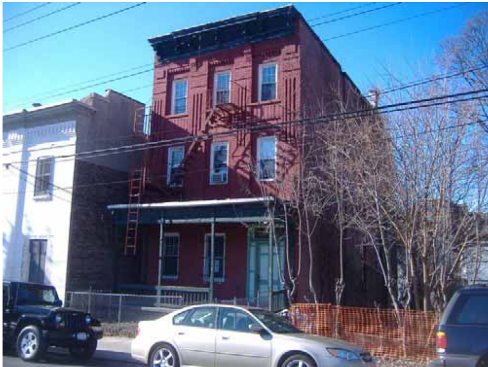
Photograph 155. Structure 299, 19 Hawthorne Avenue. A three-story brick masonry house, constructed c.1890.