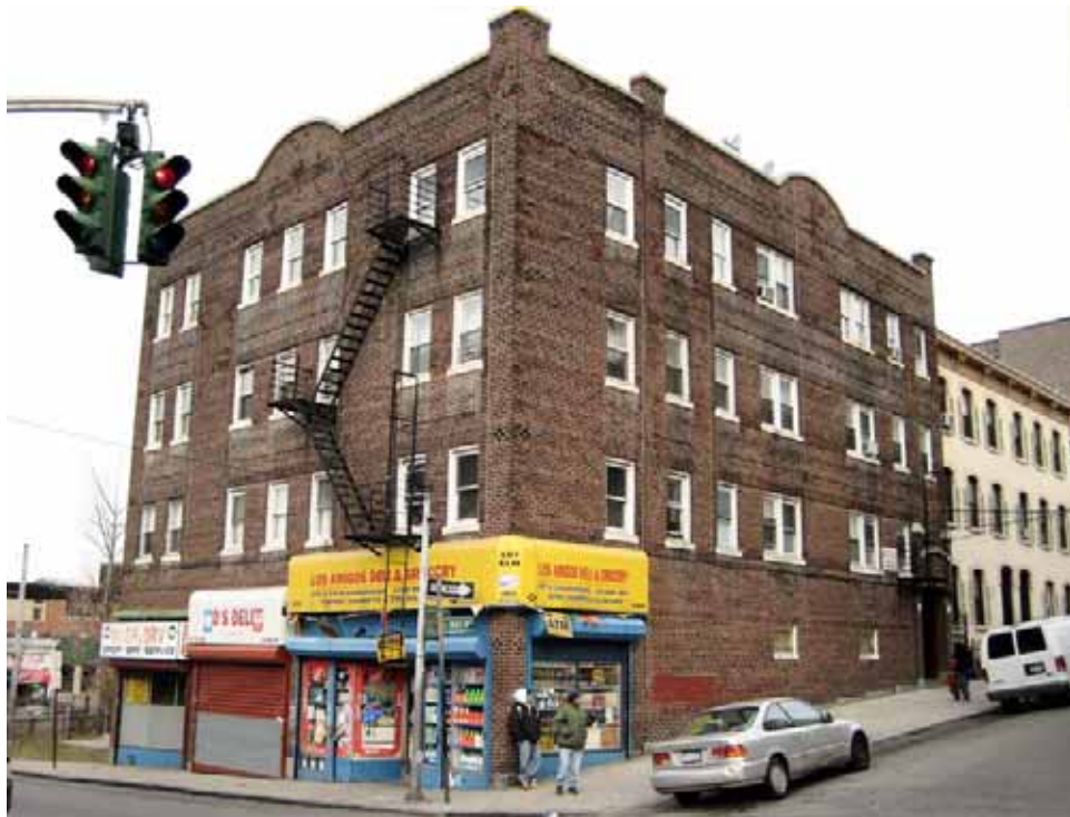
Photograph 137. Structure 261, 53 Linden Street. A four-story brick apartment house with first floor commercial spaces, constructed c.1930.