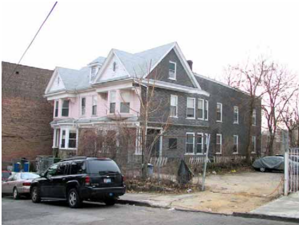
Photograph 121. Structure 219, 4-10 Overlook Terrace. A 2½-story wood-framed house with Queen Anne details, constructed c.1890.